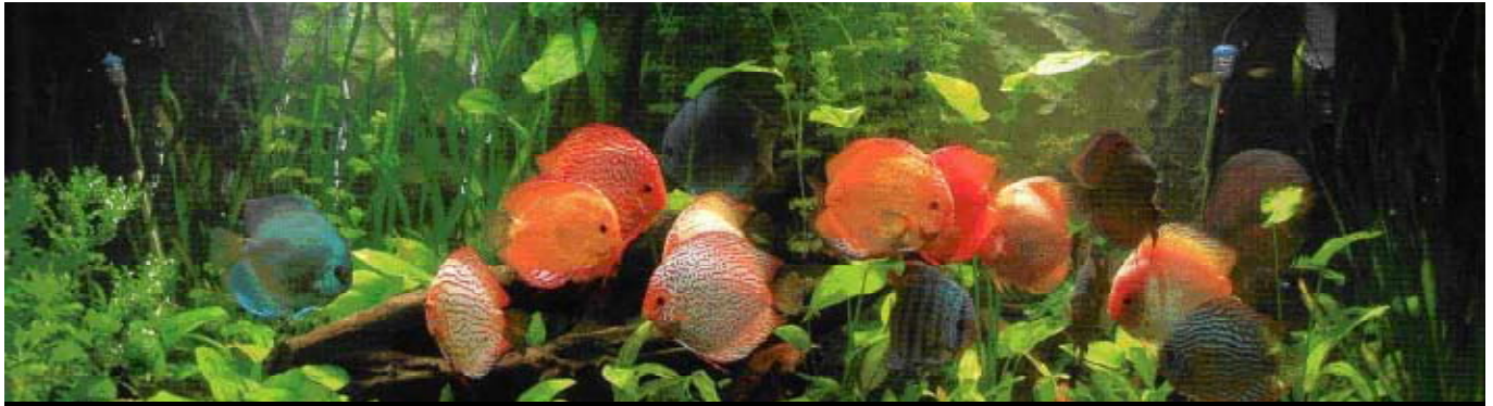
Captive bred discus fish also look most spectacular in aquariums with ample plant life.

The discus fish, which we have selectively bred over the past 47 years and have gradually and continuously acclimatised to the standard aquarium environment, are kept in normal tap water. This means they do not require a complicated acclimatisation phase, when they are introduced to a home aquarium or supplied to specialist pet shops. So, our discus fish are quite “tough”, in the best sense of the word. This also applies to diseases and illnesses. In our hatchery, we are often able to treat first signs of a fish’s poor overall condition or actual illness, by simply raising the water temperature and using activated carbon for effective water filtration – wholly without the use of any medication. This is also very advantageous when the fish are introduced to a home aquarium, as it means the fishes’ health is stable and the fish have not developed resistance to medications and are not susceptible to particular germs. So if an illness should then chance to develop, it is possible to treat it with low dosages of medication and with low-risk treatment methods.