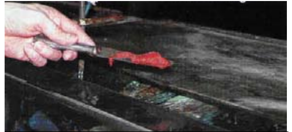
This is how we feed our discus feed in the hatchery.

The discus fish, which we have selectively bred over the past 47 years and have gradually and continuously acclimatised to the standard aquarium environment, are kept in normal tap water. This means they do not require a complicated acclimatisation phase, when they are introduced to a home aquarium or supplied to specialist pet shops. So, our discus fish are quite “tough”, in the best sense of the word. This also applies to diseases and illnesses. In our hatchery, we are often able to treat first signs of a fish’s poor overall condition or actual illness, by simply raising the water temperature and using activated carbon for effective water filtration – wholly without the use of any medication. This is also very advantageous when the fish are introduced to a home aquarium, as it means the fishes’ health is stable and the fish have not developed resistance to medications and are not susceptible to particular germs. So if an illness should then chance to develop, it is possible to treat it with low dosages of medication and with low-risk treatment methods.